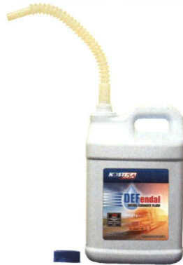
2.5 Gallon JUG w/spout 2 / Case