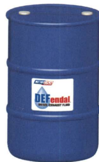
55 Gallon DRUM