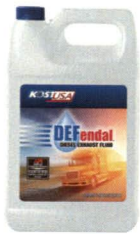
1 Gallon JUG 4 / Case