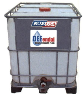
330 Gallon TOTE

For all your Diesel Exhaust Fluid and Equipment Needs Contact: